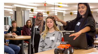
You're invited to the first VIRTUAL Women in Engineering Day

The Schulich School of Engineering at the University of Calgary is offering a free virtual event designed to introduce Grade 10 and 11 girls, and other underrepresented groups, to the exciting world of engineering! Students will discover more about the diverse array of engineering disciplines and experience a "day-in-the-life" experience of what studying engineering would be like. This online event takes place on February 24th, 2022 from 9:00 am - 12:30 p.m. You must pre-register for this event. Spots are limited so register early!!! HERE